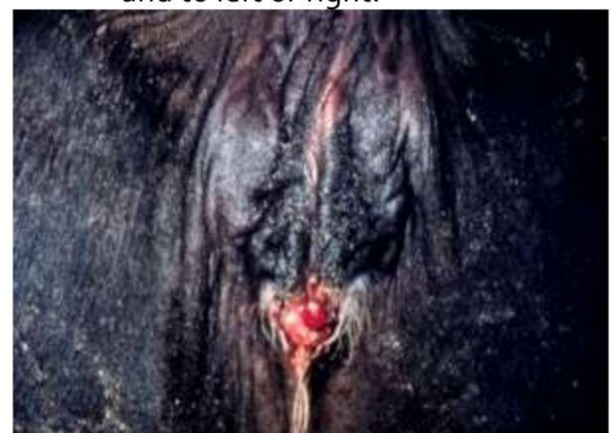
Fig: Twisting of the vulva due to right uterine torsion.

The dorsal commissure of vulva may be pulled forward and to left or right.